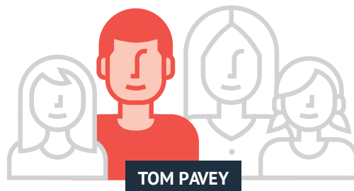
Married father of two young daughters, ages five and seven