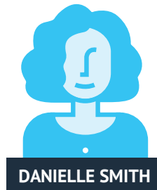
Never married, no children