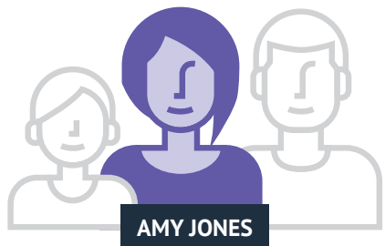
Married mother of a young son, age five